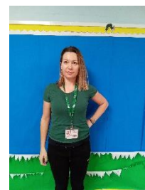
Mrs Stencil Long term supply