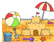
Beside the sea